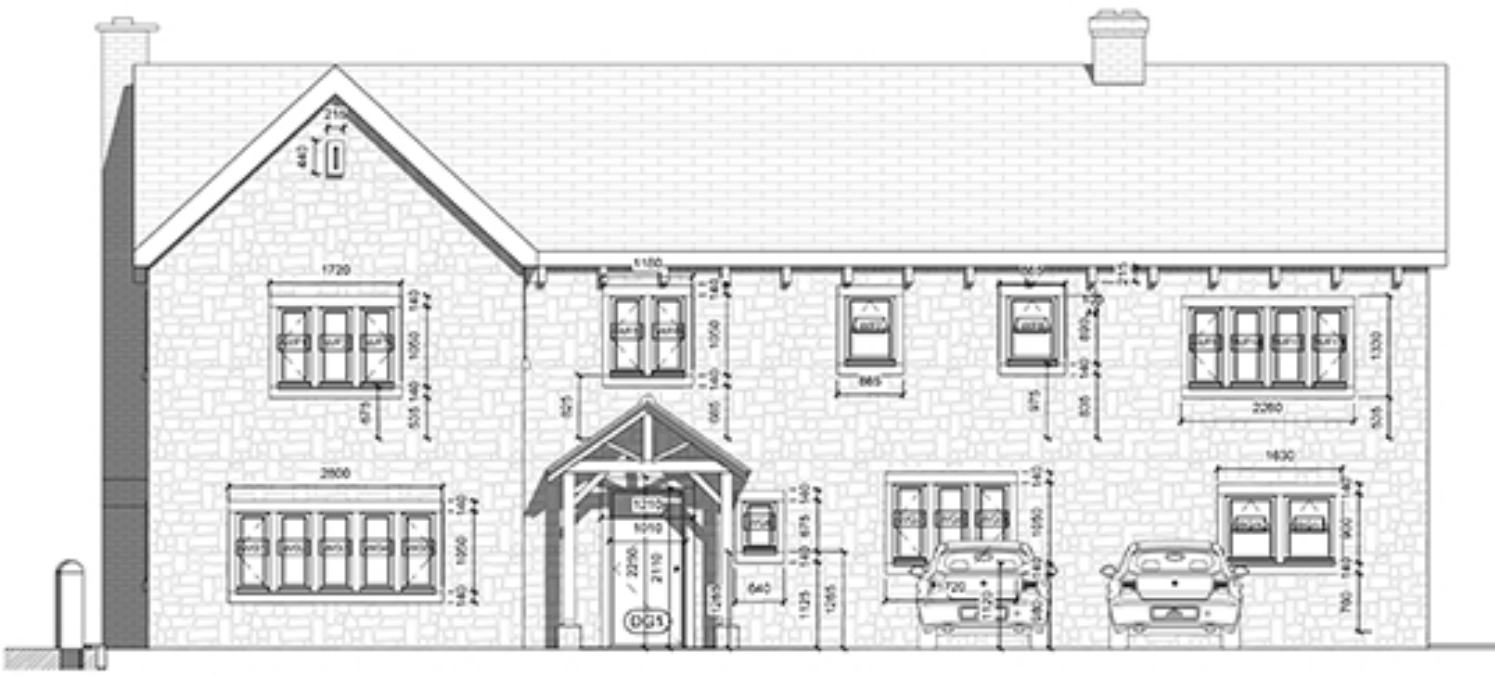
SW main elevation 1:50