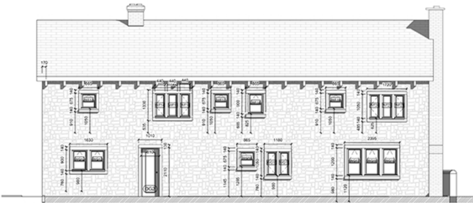
NE rear elevation 1:50